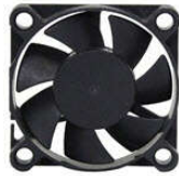
DC axial fan model ZY-4510

SIZE: 45x10mm OUTPUT: 4.5-7.22 CFM CONSTRUCTION: Glass fiber reinforced thermoplastic Impeller and housing UL94V-0 OPERATING TEMPERATURE: Sleeve bearing -10C to +70C INSULATION RESISTANCE: >10 megohm at 500VDC (frame-terminal/wires) DIELECTRIC STRENGTH: 500V/60HZ, 5mA, 1 minute (frame-terminal/wires)