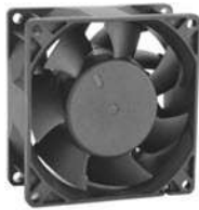
DC axial fan model ZY-F8038

SIZE: 80x38mm OUTPUT: 104.7-130.2 CFM CONSTRUCTION: Glass fiber reinforced thermoplastic Impeller and housing UL94V-0 OPERATING TEMPERATURE: Sleeve bearing -10C to +70C INSULATION RESISTANCE: >10 megohm at 500VDC (frame-terminal/wires) DIELECTRIC STRENGTH: 500V/60HZ, 5mA, 1 minute (frame-terminal/wires)