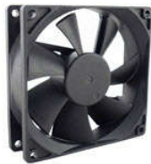
DC axial fan model SD09025

SIZE: 90x25mm OUTPUT: 39.82-54.73 CFM CONSTRUCTION: Glass fiber reinforced thermoplastic Impeller and housing UL94V-0 OPERATING TEMPERATURE: Sleeve bearing -10C to +70C INSULATION RESISTANCE: >10 megohm at 500VDC (frame-terminal/wires) DIELECTRIC STRENGTH: 500V/60HZ, 5mA, 1 minute (frame-terminal/wires)