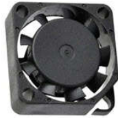
DC axial fan model DFH2010

SIZE: 20x10mm OUTPUT: 0.85-1.89 CFM CONSTRUCTION: Glass fiber reinforced thermoplastic Impeller and housing UL94V-0 OPERATING TEMPERATURE: Sleeve bearing -10C to +70C INSULATION RESISTANCE: >10 megohm at 500VDC (frame-terminal/wires) DIELECTRIC STRENGTH: 500V/60HZ, 5mA, 1 minute (frame-terminal/wires)