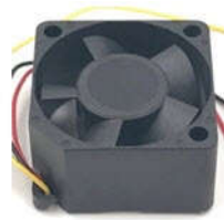
DC axial fan model AV-F3015

SIZE: 30x15mm OUTPUT: 3.8-6.1 CFM CONSTRUCTION: Glass fiber reinforced thermoplastic Impeller and housing UL94V-0 OPERATING TEMPERATURE: Sleeve bearing -10C to +70C INSULATION RESISTANCE: >10 megohm at 500VDC (frame-terminal/wires) DIELECTRIC STRENGTH: 500V/60HZ, 5mA, 1 minute (frame-terminal/wires)