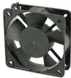
AC axial fan type SA13538

For more information please contact our Customer Service Department